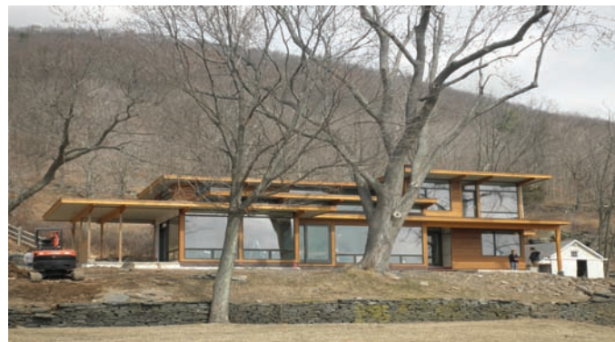
TD3 3020 under construction

These homes are not only beautiful - they are efficient and environmentally responsible. Turkel Design Lindals for the Dwell Homes Collection were honored as one of the Green Design 100 in Time Magazine's Style and Design Issue (May 2009).